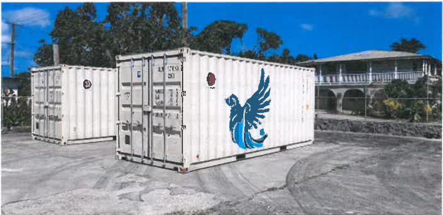
Anglican Missions Prepositioned Emergency supplies located at four locations in Tonga

We will provide regular updates on our website as well as on Facebook and Instagram .