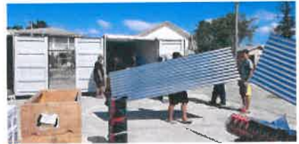
Anglican Missions Prepositioned Emergency supplies located at four locations in Tonga

On 15 January the underwater Hunga Tonga-Hunga Ha'apai volcano erupted leading to significant ash falls across Tonga and triggering tsunami waves. While electricity and mobile phone networks have been re-established on the main island of Tongatapu, communications with the outer islands are intermittent. The Tongan Navy has reported major damage in the Ha'apai Islands. Waves were estimated to be 5-10 metres in height and reaching 500 metres inland. The needs on the ground will be significant , especially in the northern more isolated islands. Pending assessments, the damage could include contaminated water and food supplies as a result of ashfall and damage due to inundation.